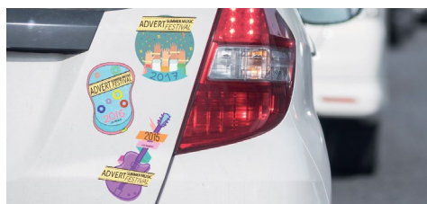
LABELS AND STICKERS