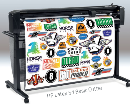
HP Latex 54 Basic Cutter

Grow your business by enhancing your HP Latex printer with our unique print AND cut workflow 1