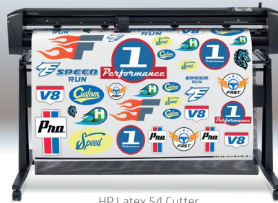
HP Latex 54 Cutter