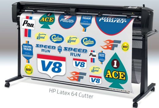
HP Latex 64 Cutter